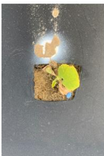
Fig 3. Residual activity of Roundup if plant lands in "old" hole vs. a "new" hole.*

Row Middle. 1) Dual Mag. rate can be increased to 1.33 pt/A. 2) Use Sandea 0.75 oz/A + surfactant for nutsedge and radish; do not contact crop directly. 3) Treflan, up to 1.5 pt/A, can be applied as a directed spray when plants are > 4 leaf; irrigate within 24 hr. 4) Roundup, Liberty, Gramoxone, and Aim can be applied under hoods; avoid drift.