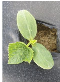
Fig 4. Cucurbit Response to Liberty Applied Preplant Over Mulch