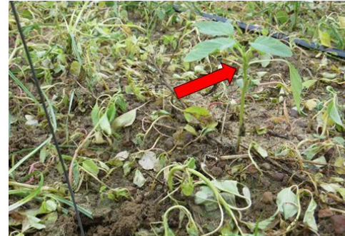
Fig 3. Virgin Palmer response to RU + dicamba.