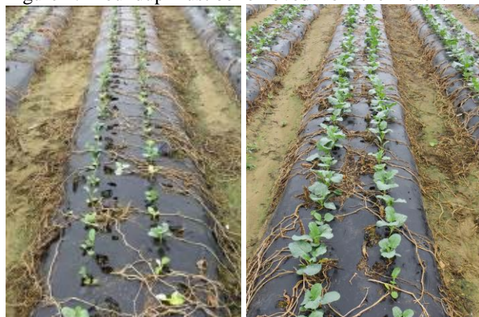
Roundup on mulch